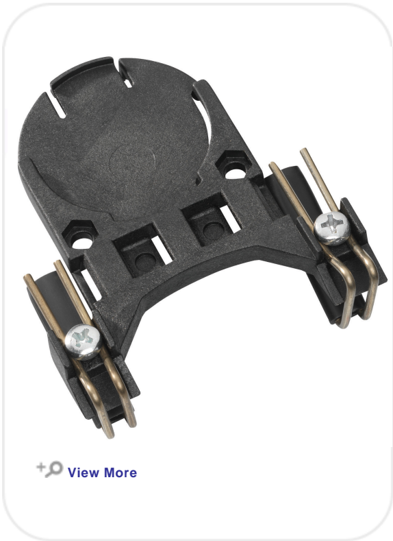
PRODUCT NUMBER: 1000240 Universal Adaptor 3702